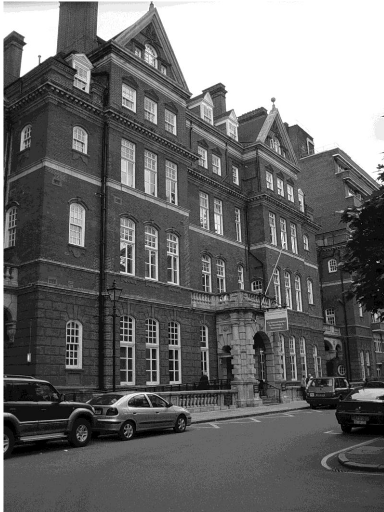
Figure 1: The main entrance to the National Hospital, Queen's Square in 2002. Ratio Club meetings were held in a room in the basement.

1980s. There are inconsistencies between these sources, but through cross-referencing with notes made at meetings and correspondence between members this list is believed to be accurate. It is possible that it is incomplete – if so, only a very small number of additional meetings could have occurred.