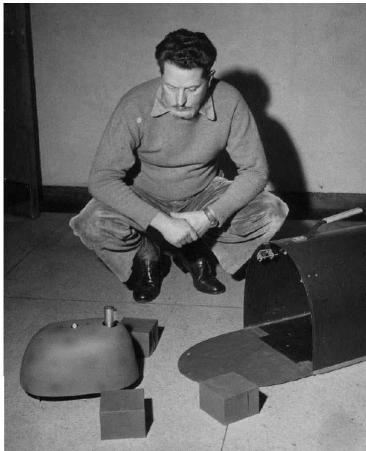
Figure 4: Grey Walter watches one of his tortoises push aside some wooden blocks on its way back to its recharging hutch. Circa 1952.

There was much discussion in meetings of what kind of intelligent behaviour might be possible in artefacts and, more specifically, how the new general purpose computers might exhibit mind-like behaviour. Mackay was quick to point out that “the comparison of contemporary calculating machines with human brains appears to have little merit, and has done much to befog the real issue, as to how far an artefact could in principle be made to show behaviour of the type which we normally regard as characteristic of a human mind.” (Mackay 1951)