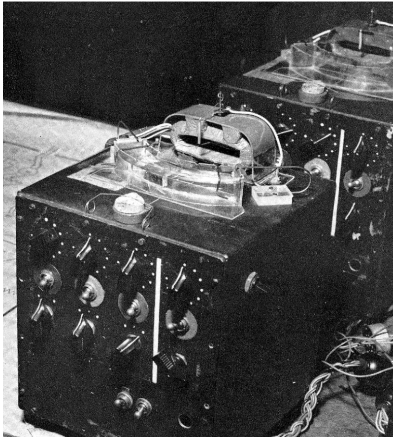
Figure 3: The Homeostat. Two of the four units can be seen.

parameters of the system by changing potentiometer and commutator values. This mechanism was triggered when one of the essential variables (proportional to the magnet's deviation) went out of bounds. The system continued to reset parameters until a stable configuration was reached whereby no essential variable were out of range and the secondary feedback mechanisms became inoperative. The units could